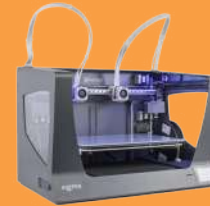
3D Printer BCN3D SIGMAX