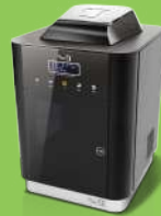
3D Printer CUBICON STYLE