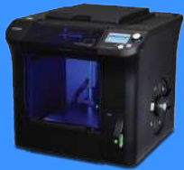
3D Printer CUBICON SINGLE PLUS

3D Printing & 3D Scanning 3D Design & Modelling Product Prototyping Rental & Exhibition